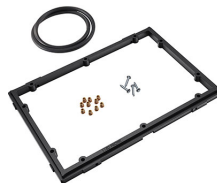
1150PF Special Application Panel Frame