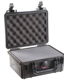
1150WF With Foam