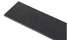
1150TPDIV Extra TrekPak Dividers