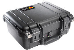
1400NF No Foam