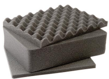
1401 3 pc. Replacement Foam Set