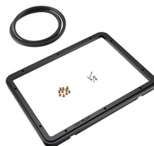
1400PF Special Application Panel Frame