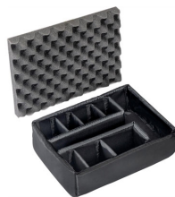
1455 Padded Divider Set