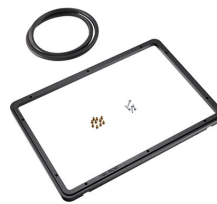
1450PF Special Application Panel Frame