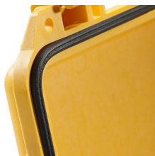
1453 Replacement O-ring