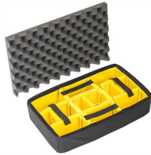
1485AirDS Padded Divider Set