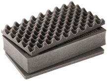
1485AirFS 3 pc. Replacement Foam Set