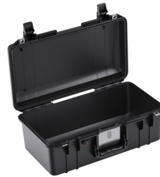
1506NF No Foam