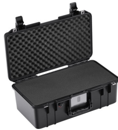
1506WF With Foam