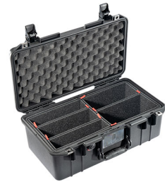
1506TP With TrekPak Divider System