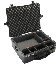
1600TP With TrekPak Divider System