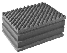
1601 4 pc. Replacement Foam Set