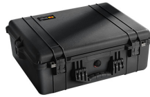
1600NF No Foam