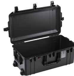
1606NF No Foam