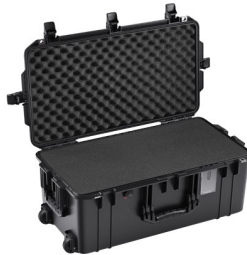
1606WF With Foam