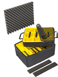
1607AirDS Padded Divider Set