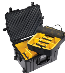
1607WD With Padded Dividers