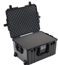
1607WF With Foam