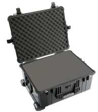
1610WF With Foam