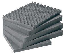
1611 5 pc. Replacement Foam Set