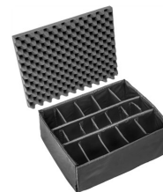
1615 Padded Divider Set