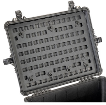
1610MP EZ Click MOLLE Panel