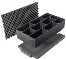
1610TPKIT TrekPak Case Divider Kit