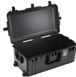
1626NF No Foam