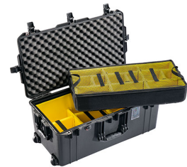
1626WD With Padded Dividers