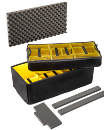
1626AirDS Padded Divider Set