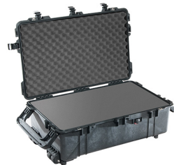
1670WF With Foam