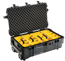
1674 With Padded Dividers