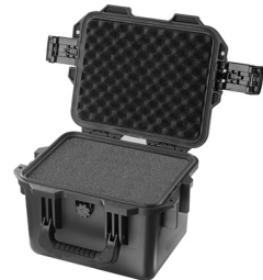
iM2075-X0001 With Foam