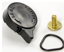
iM-VALVE-M-B Manual Purge Valve