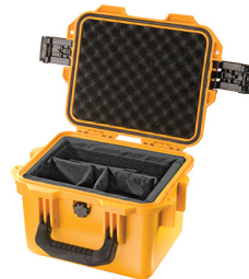
iM2075-X0002 With Padded Dividers