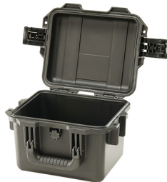
iM2075-X0000 No Foam