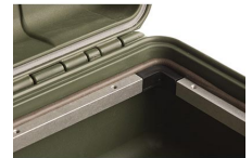
iM2300-BEZEL Base Bezel Kit