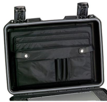
iM2300-LIDORG Lid Organizer