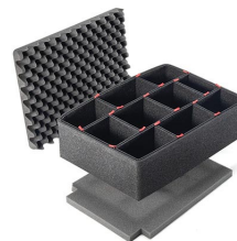
iM2450TPKIT TrekPak Case Divider Kit