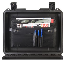
iM24XX-LIDORG Lid Organizer