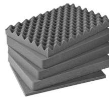
iM2450-FOAM 5 pc. Replacement Foam Set