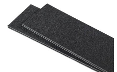
iM2450TPDIV Extra TrekPak Dividers