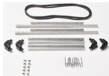
iM24XX-BEZEL-LID Lid Bezel Kit