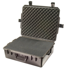
iM2700-X0001 With Foam