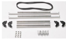
iM27XX-BEZEL-LID Lid Bezel Kit